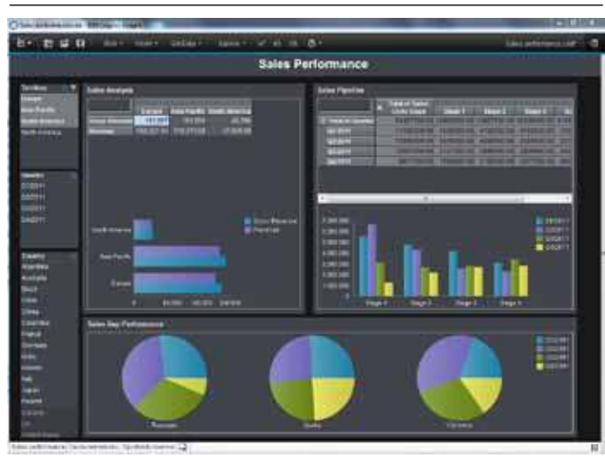
Figure 2: Interactive dashboards can include elements from any Cognos Express module and be easily shared company wide. Users can also move seamlessly from assembly to self-service authoring and deeper analysis.

With Cognos Express, data is presented in a business context that business users understand while ensuring data accuracy and consistency throughout the organization. This allows executives and managers in different departments to spend more time analyzing data and less time arguing over what data is correct. Write-back capabilities allow these insights to be turned into specific plans and actions for better business outcomes—for example, to align the right resources to capitalize on new opportunities.