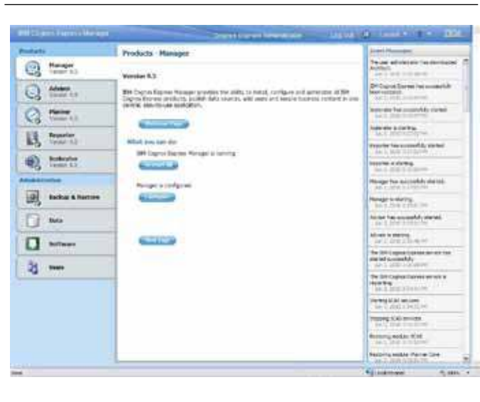
Figure 5: A web-based console manages all administrative aspects of installation, deployment and maintenance.

This shared foundation enables you to add new Cognos Express capabilities with “plug-and-play” ease.