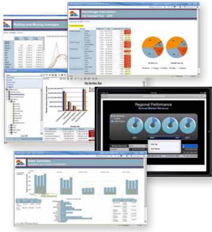
Figure 3: An intuitive, easy-to-use interface provides complete, self-service access to reports and analysis. Users can even receive business insights on their Apple iPad devices with a free application available from the Apple App Store.